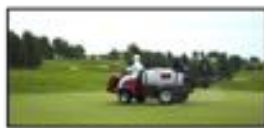
Toro MultiPro 1750

Premier provider of beautification solutions